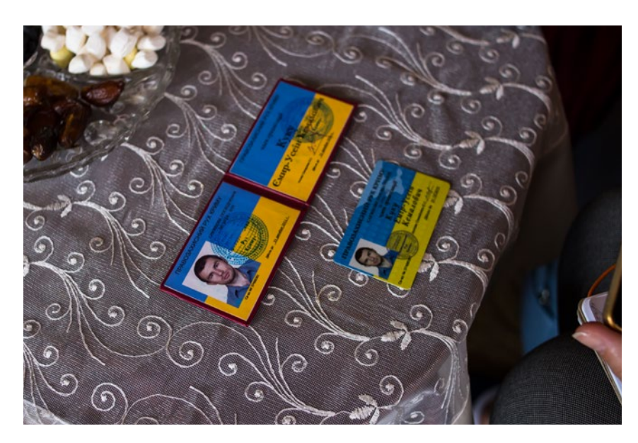
Emir-Usein Kuku's personal documents.