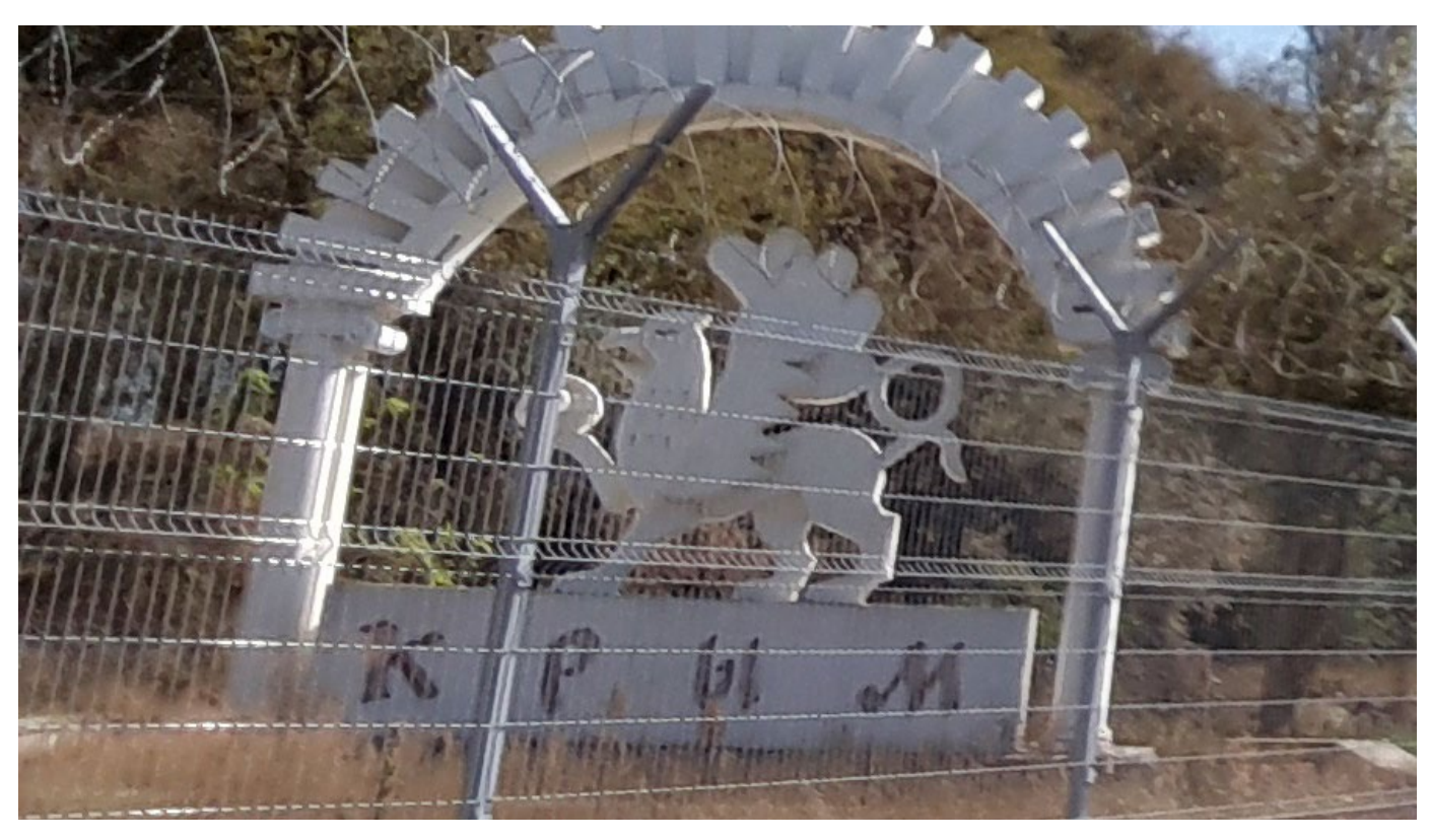
Entrance to Crimea. Photo taken at the Kalanchak-Armyansk border crossing point.

citizens violating rules on access to Crimea are prohibited from entering Ukraine for a period of three years, and the law foresees administrative and criminal sanctions. A subsequent amendment broadened the category of foreigners eligible to apply for a permit and included foreign NGOs and international human rights missions and journalists.<sup>36</sup>