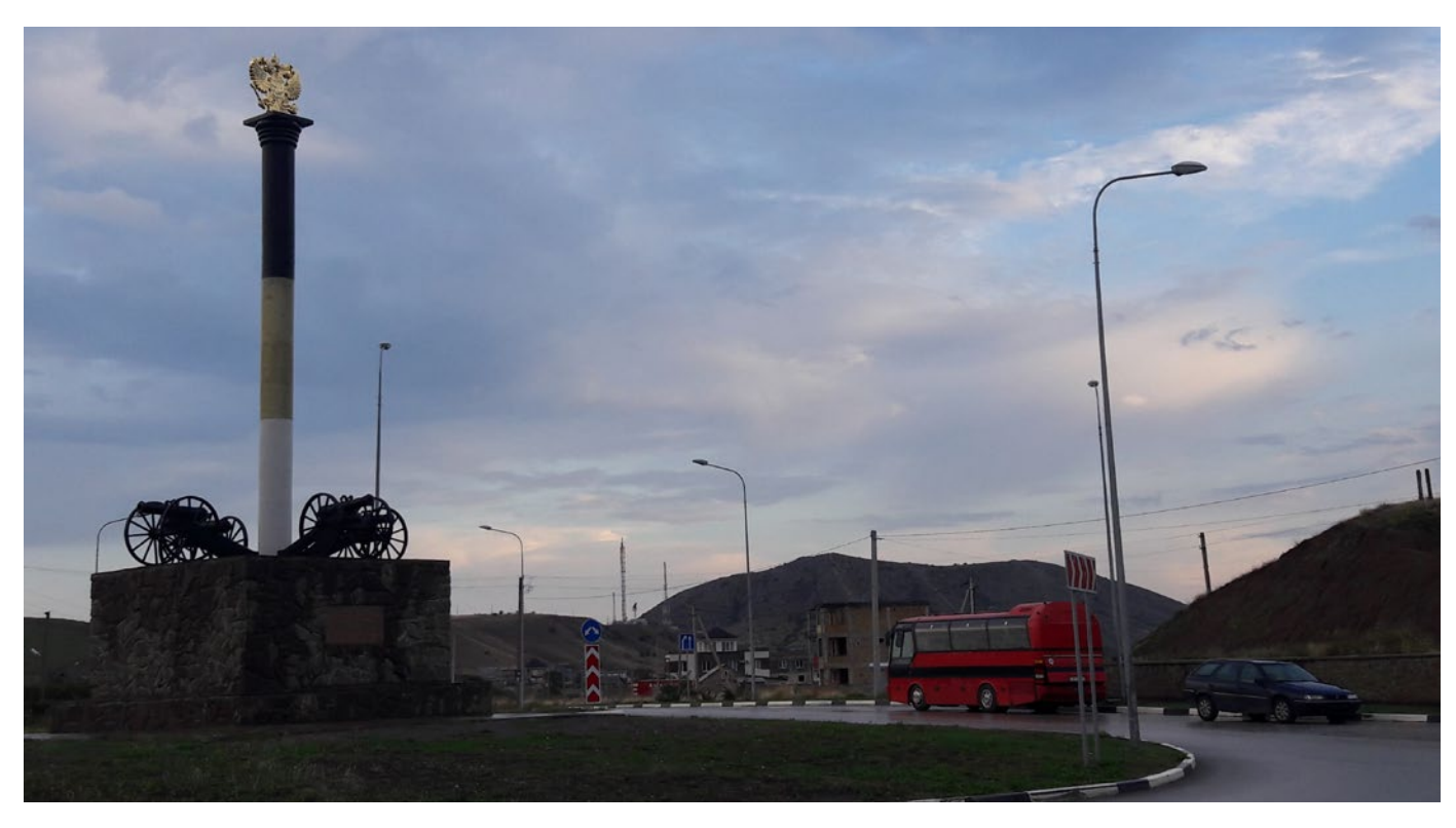
Monument to the Novgorod-Kirillov regiment, which was stationed at the Genoese Fortress arrived in Sudak after the annexation of Crimea by the Russian Federation.

occupation. Ordinary citizens are lost and disoriented. Some people who supported the occupation feel that promises have not been kept, while people who moved to Crimea from Russia are also beginning to feel disappointed, as living conditions are different and it is easier to get into conflict with the law.