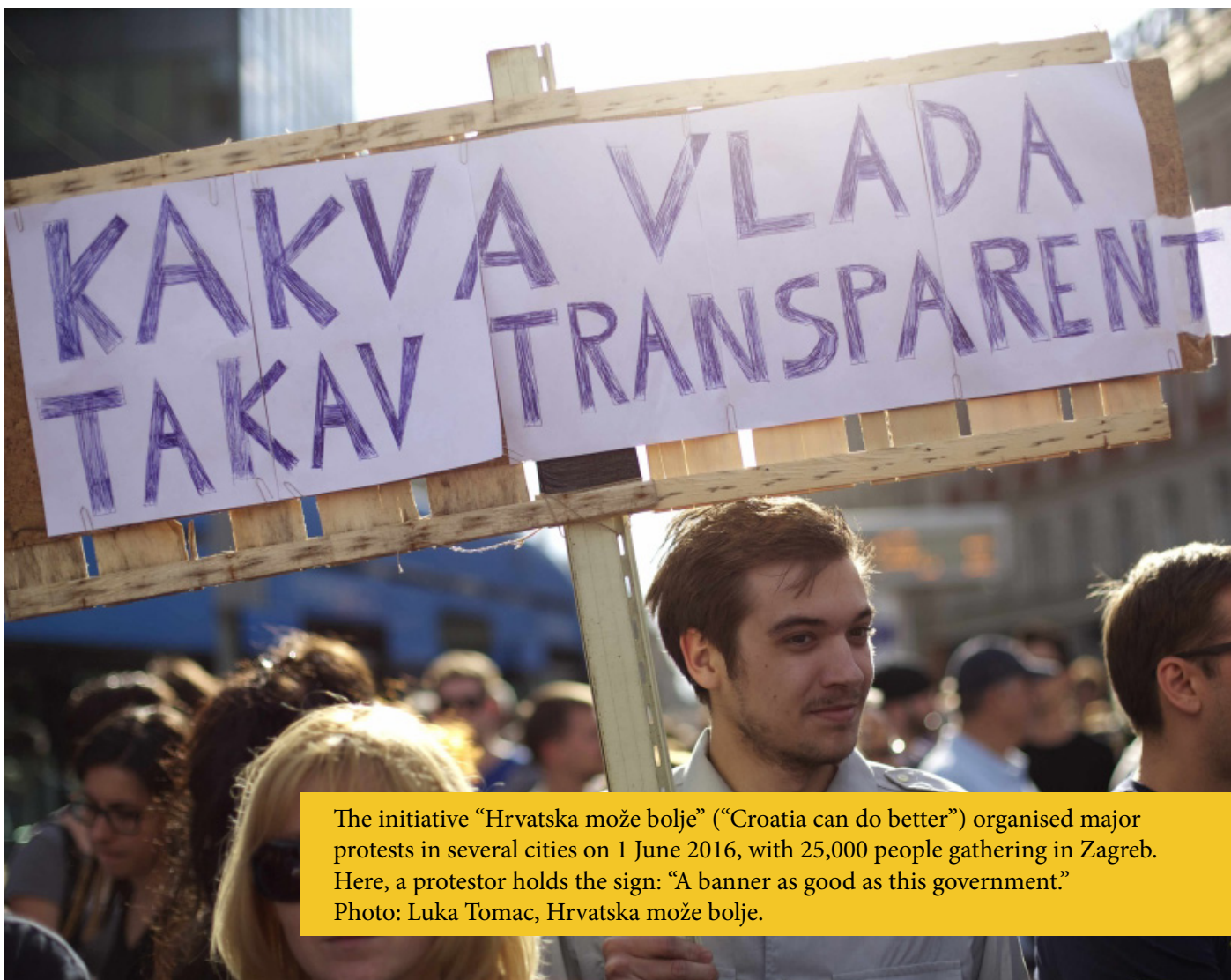
The initiative “Hrvatska može bolje” (“Croatia can do better”) organised major protests in several cities on 1 June 2016, with 25,000 people gathering in Zagreb. Here, a protestor holds the sign: “A banner as good as this government.”

better answer than human rights to socio-economic issues, as Platforma 112 did: “We need to start insisting that the catalogue of human rights includes – equally – both categories of rights.” 120