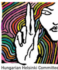
Hungarian Helsinki Committee