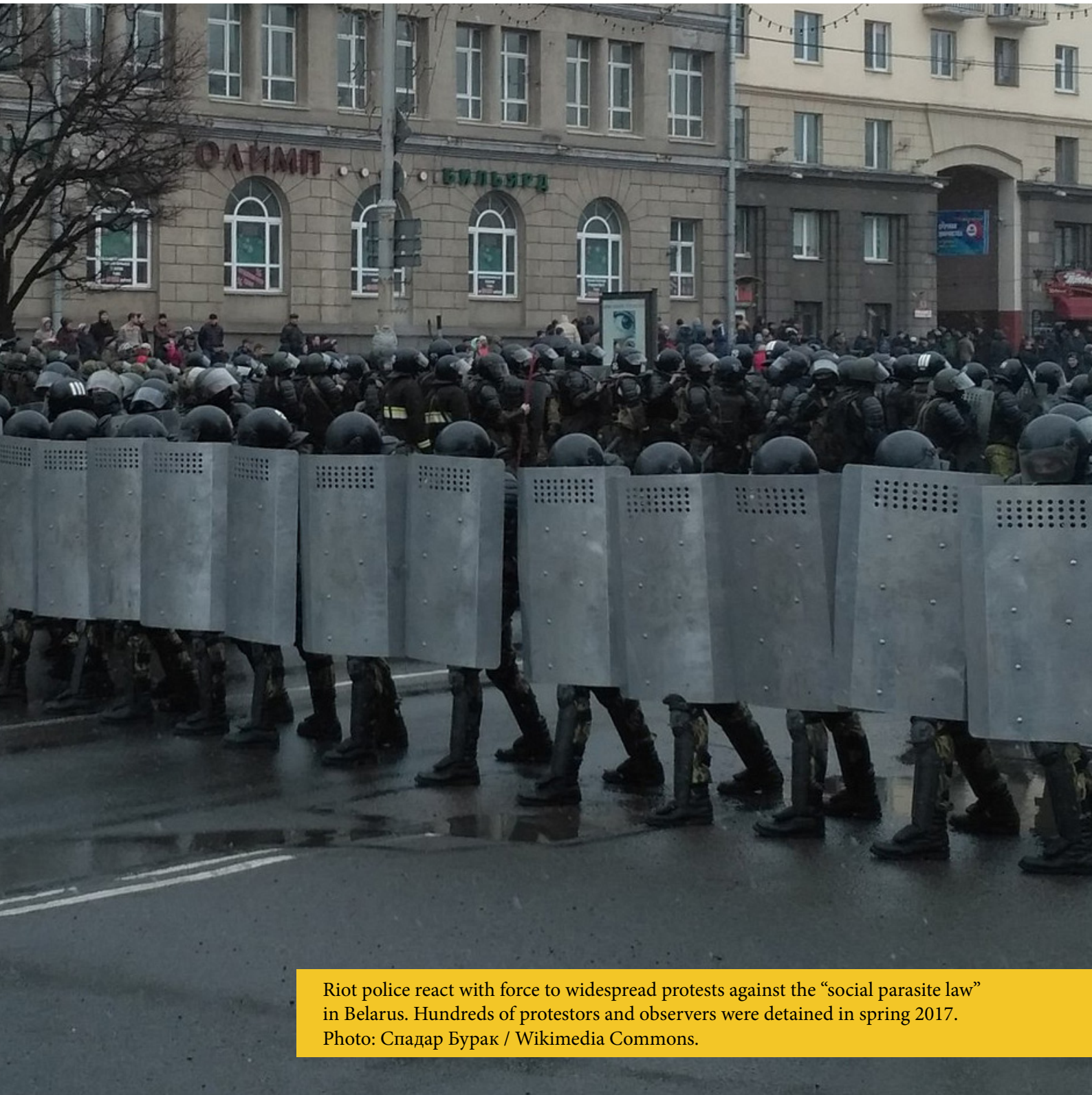
Riot police react with force to widespread protests against the “social parasite law” in Belarus. Hundreds of protestors and observers were detained in spring 2017.