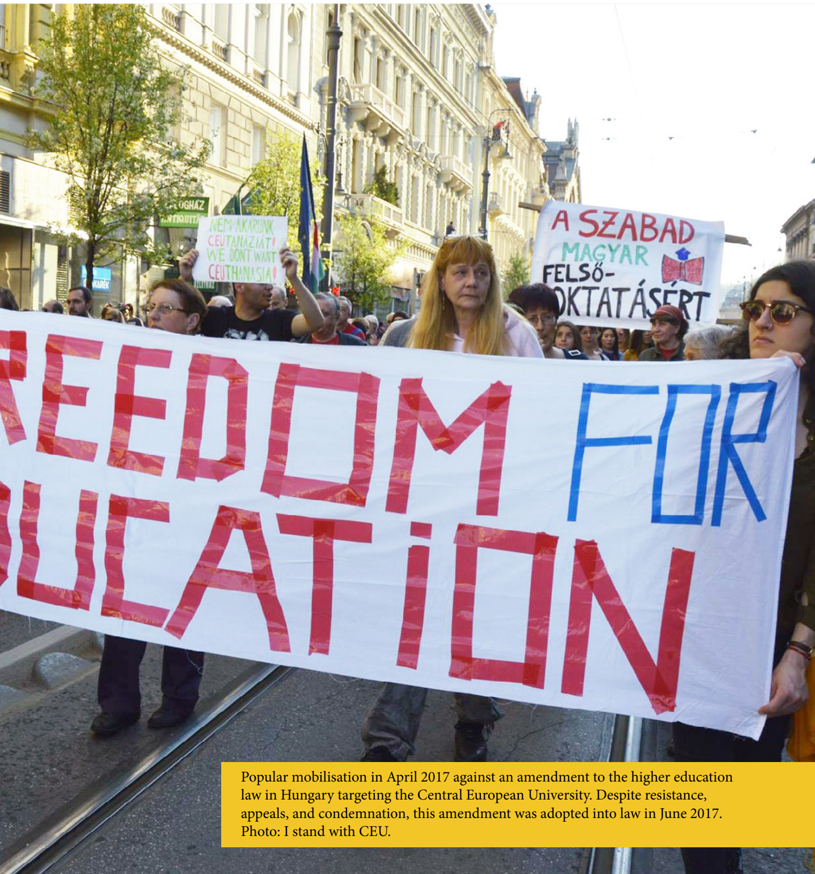
Popular mobilisation in April 2017 against an amendment to the higher education law in Hungary targeting the Central European University. Despite resistance, appeals, and condemnation, this amendment was adopted into law in June 2017.