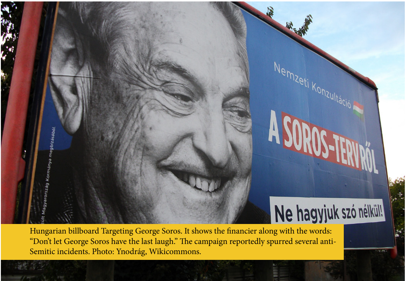
Hungarian billboard Targeting George Soros. It shows the financier along with the words: “Don’t let George Soros have the last laugh.” The campaign reportedly spurred several anti-Semitic incidents.

“finance anti-Christian and anti-national activities.” 92 Jarosław Kaczyński accused Soros of trying to destroy traditional societies by forcing multiculturalism on them.